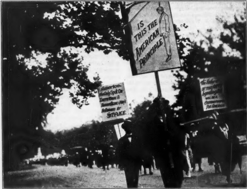
THE ANTI-LYNCHING PARADE, WASHINGTON, D. C.